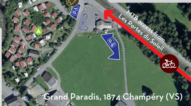
Grand Paradis, 1874 Champéry (VS)

Pedestrian/bicycle access to the event site