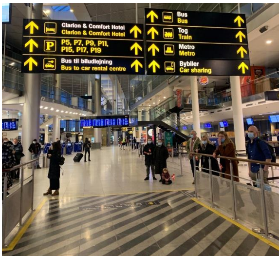
Arrival hall in Copenhagen Airport.

Having exited the baggage claim area, you find yourself in the arrival hall of Copenhagen Airport. Walk straight ahead and you will reach the train tracks.