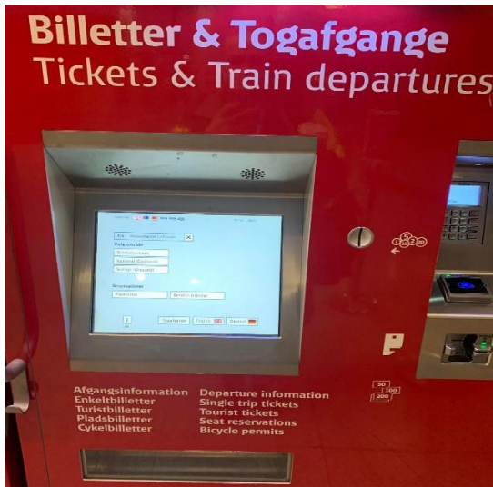
Ticket vending machine. International credit card accepted.

Take the IC or ICL trains in direction of Aalborg/Aarhus. They all stop in Odense with a travel time of approx. 1.5 hours. Look for the departures with a yellow mark. Below you see an example of the monitor with train departures from Copenhagen airport.