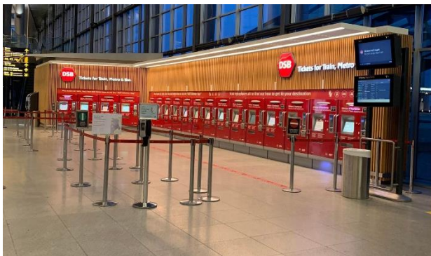
Ticket vending machines.

Just before the tracks, there are ticket vending machines and a vending booth.