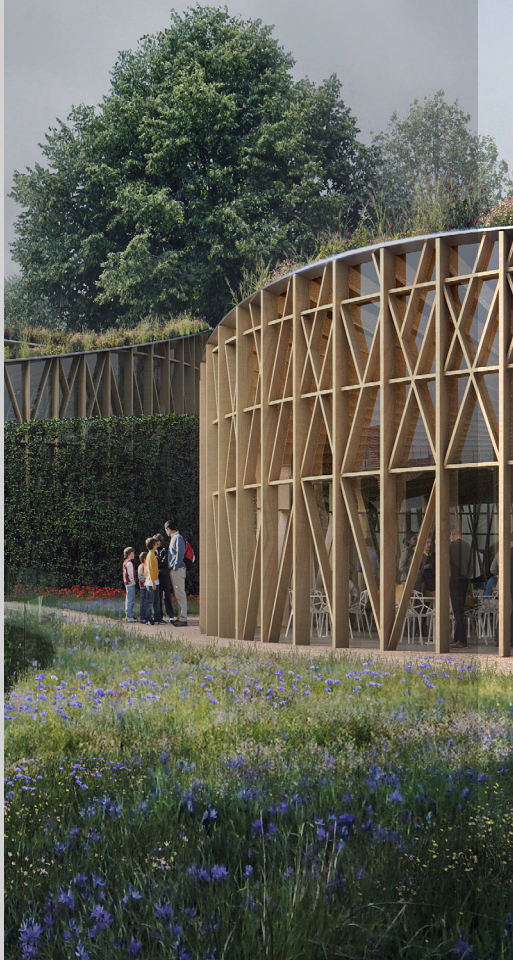
HANS CHRISTIAN ANDERSEN HOUSE