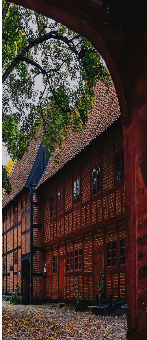
THE HISTORIC QUARTER